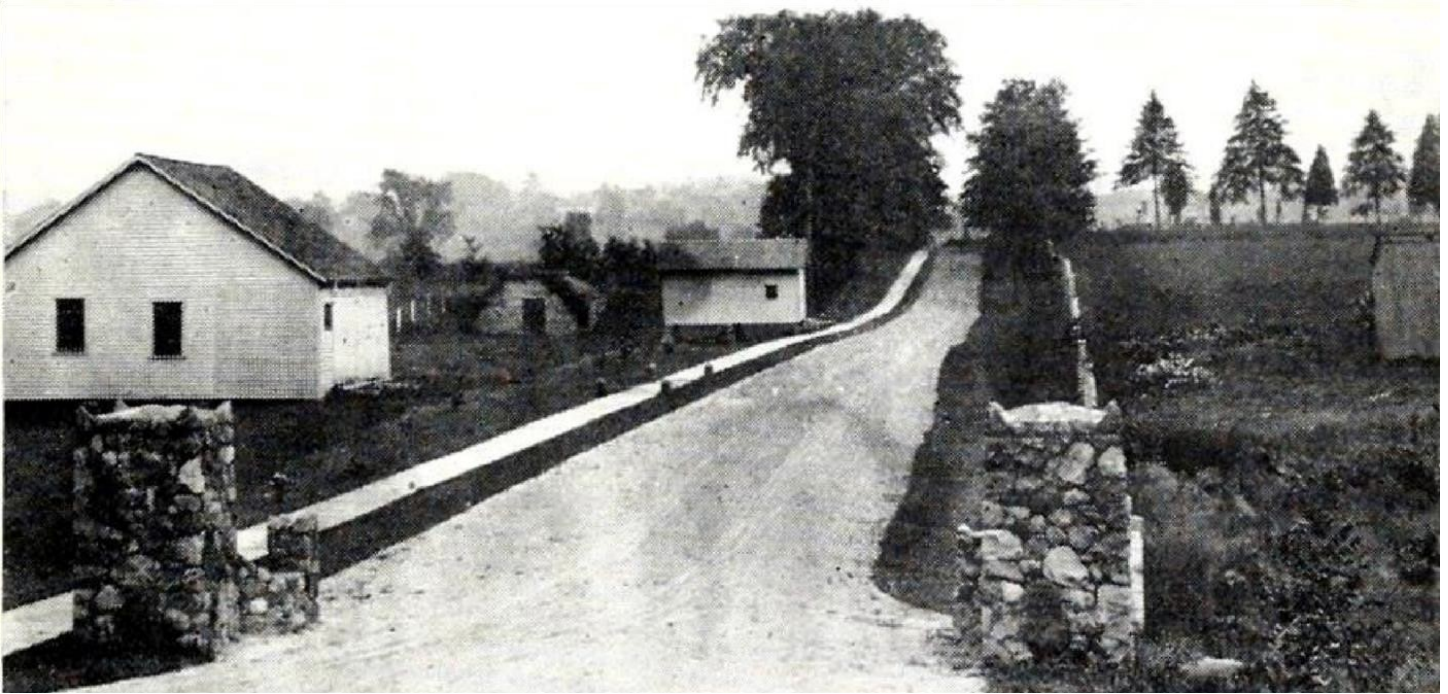
Above, Cemetery Lane to Locust Grove Cemetery