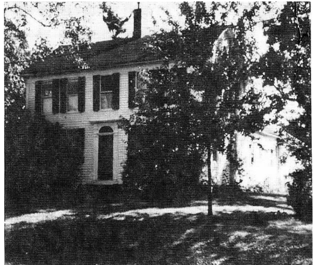
The Starkweather Tavern