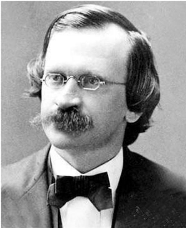
Rev. Edward Morley

1868, Rev. Edward Morley becomes minister of the First Congregational Church. While in Twinsburg Rev. Morley realized he loved teaching more than preaching. In 1869, Western Reserve College in Hudson offers Rev. Morley the dual position of Chemistry Professor and College Chaplain, Rev. Morley accepted. In 1882, Reserve College moves to University Circle in Cleveland and becomes Adelbert College of Western Reserve University. There Edward Morley teams up with Albert Michelson, professor of physics. In 1887 Morley and Michelson devised an experiment to detect the relative motion of light through the luminiferous aether. The luminiferous aether was the 19th century explanation of how light waves travelled through the vacuum of space. Physicists at the time believed the speed of light varied with the speed of the light source and direction of the luminiferous aether. Their experiment used a beam of light split in different directions to see the effects of the aether and the speed of the light source (Earth travelling at 66,600 mph). Their famous “null” result was used years later to justify Albert Einstein’s 1905 theory of special relativity which stated that the speed of light is constant regardless of the direction or velocity of one's motion.