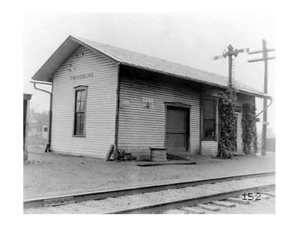
Twinsburg Train Depot. Located on Depot St. at the bottom of Cannon Road.