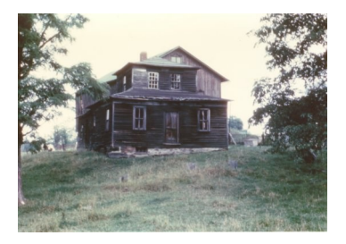
Ethan Alling House

Ethan Alling House First residence in Millsville in 1817. The first house was located on Ravenna Road near the intersection of Old Mill Road and Ravenna Road. A barn currently stands near the location of the first house.