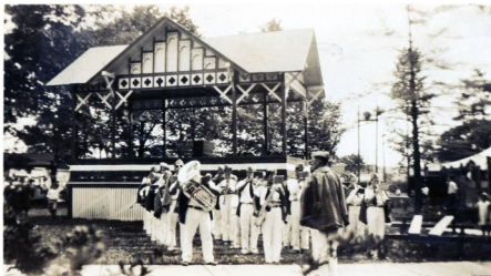
Bandstand on the Square