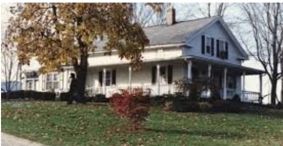
Corbett's Farm and Farmhouse