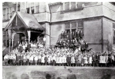
Original "Old School"